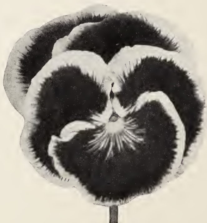
One of "Bud's" Mastodons